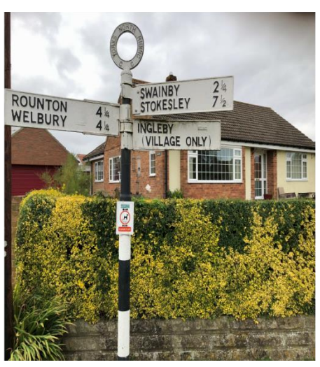
Produced by the Neighbourhood Development Plan Steering Group on behalf of Ingleby Arncliffe Parish Council.