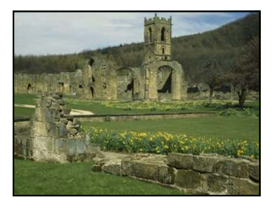
Mount Grace -Ruins of a 14th-century Carthusian Priory

Bring your folding chairs, rugs, blankets and picnics. Grab a spot on the grass then sit back and enjoy.